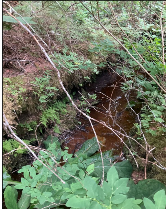
Figure 2. Upstream at waypoint 501.