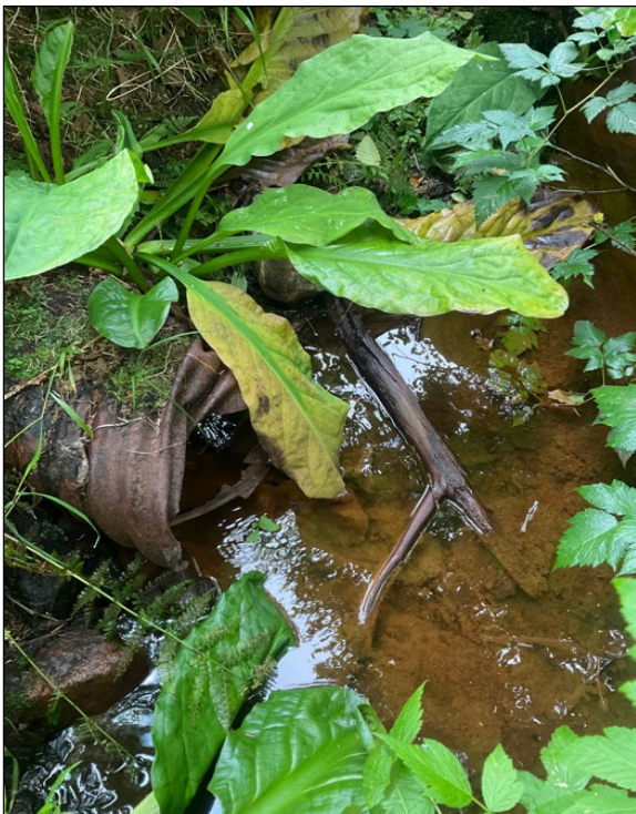
Figure 3. Culvert inlet at waypoint 480.