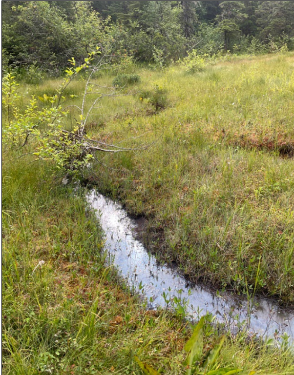
Figure 1. Downstream at waypoint 505.