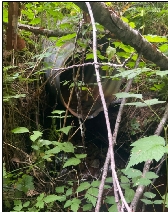
Figure 4. Culvert outlet at waypoint 480.