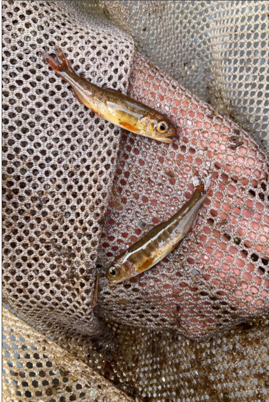
Figure 5. Juvenile coho salmon caught at waypoint 506.